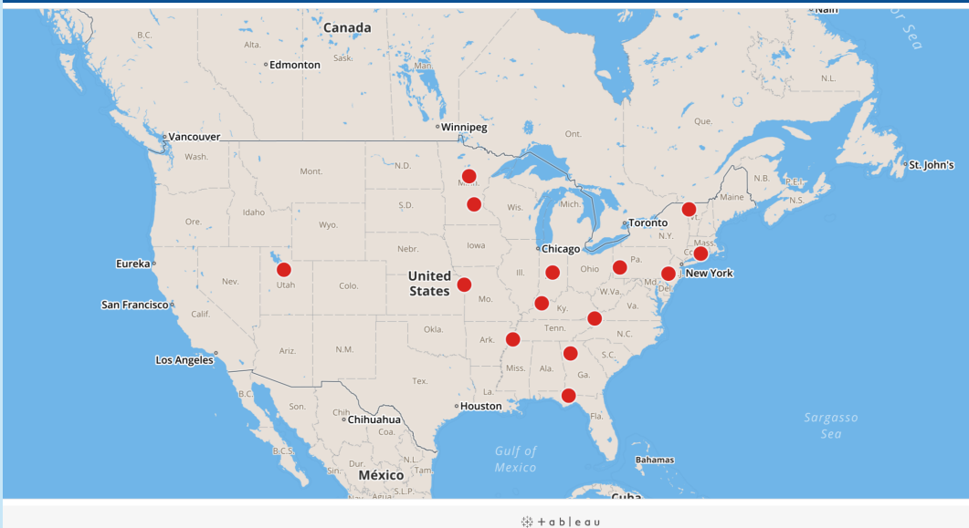
Screenshot 2: 14 actually labeled as failures

For decades, local governments have made promises of faster and cheaper broadband networks. Unfortunately, these municipal networks often don't deliver or fail, leaving taxpayers to foot the bill. Explore the map to learn about the massive debt, waste and broken promises left behind by these failed government networks.