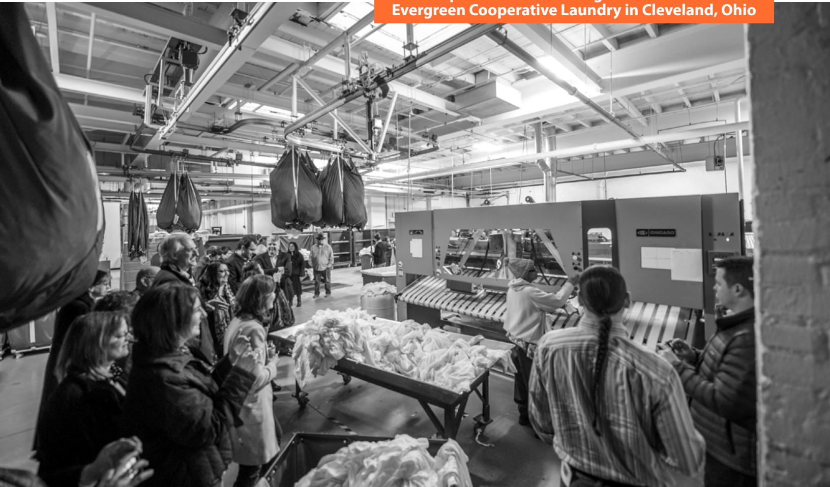
Participants in the Learning Action Lab tour the Evergreen Cooperative Laundry in Cleveland, Ohio

While rich in community connection and culture, Native Americans remain the economically poorest minority group in the United States—with poverty rates around 25 percent, median earnings substantially lower than the rest