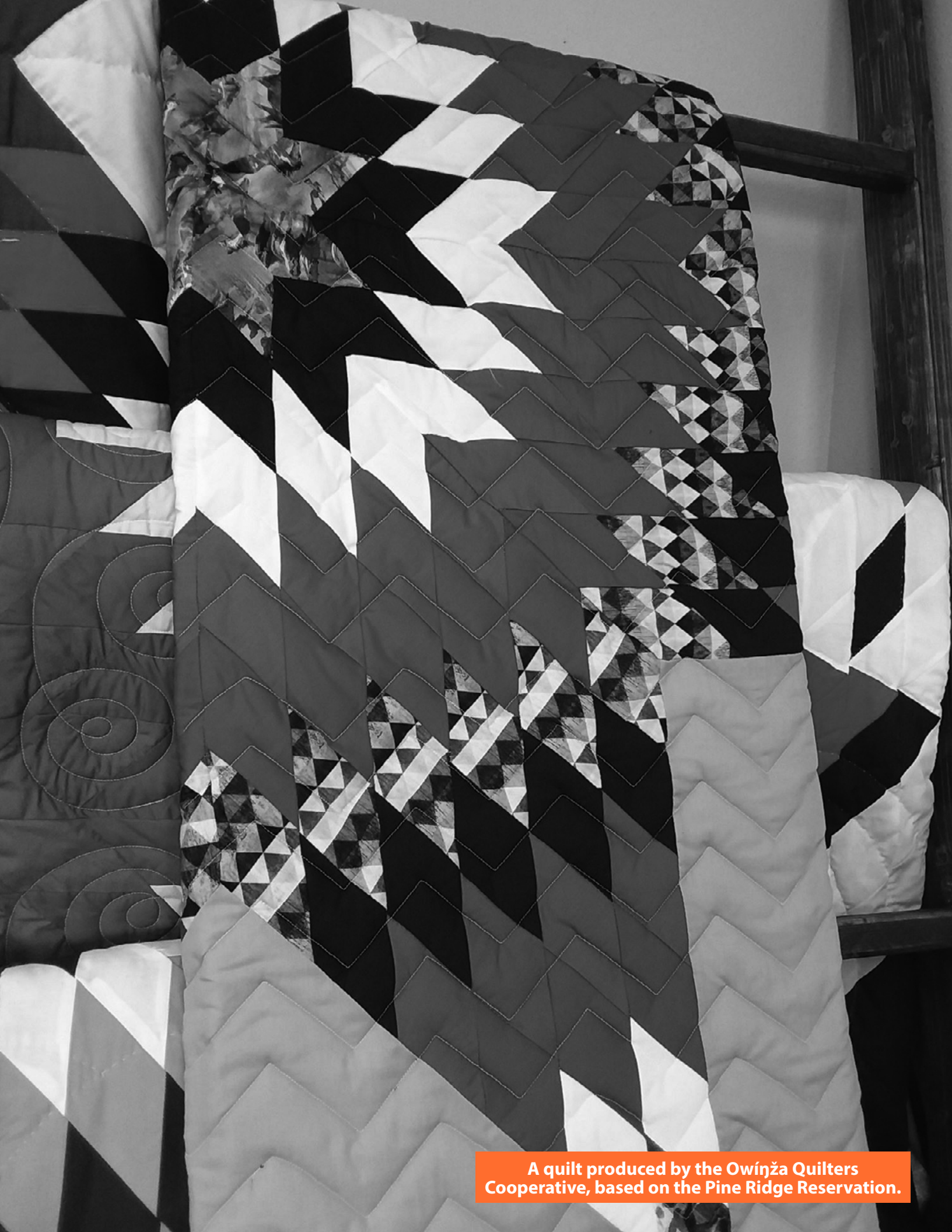
A quilt produced by the Owín̄ža Quilters Cooperative, based on the Pine Ridge Reservation.