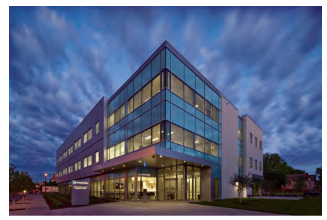
Global Cardiovascular Innovation Center.