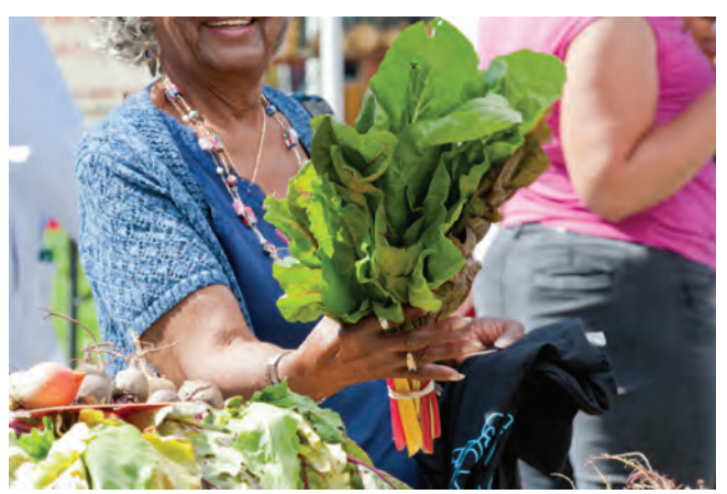
Cleveland Clinic's community farmer's market (September 2012).

Several reasons have prompted Cleveland Clinic to more prominently acknowledge its role as an anchor institution. Cleveland Clinic recognizes that the strength of the organization is heavily dependent upon the strength of the neighborhoods it serves. Therefore, its priority to ensure the health of its surrounding community has spurred a greater focus on active engagement as a community partner. Cleveland Clinic's community outreach goals now include: strengthening community life through effective, sustainable health education and outreach programs focusing on vulnerable and at-risk populations; enhancing neighborhoods through community building collabora-