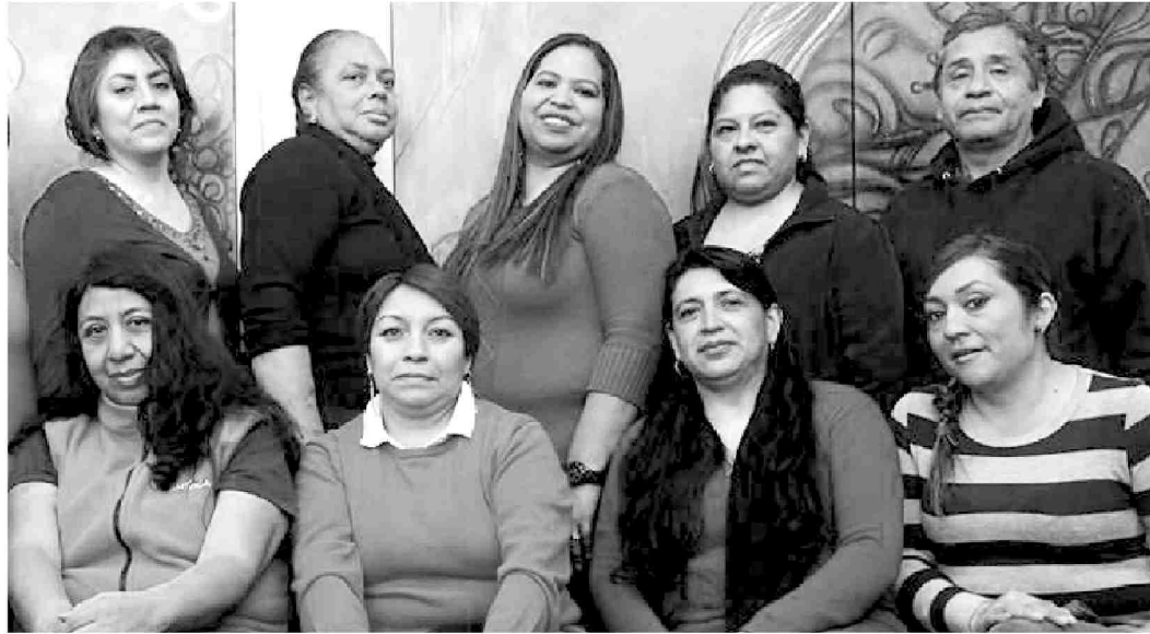
Members of Pa'lante Green Cleaning worker cooperative. Jackson Heights, Queens. 2014.