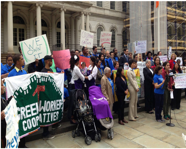
Ecomondo Cleaning Cooperative

paradigm. This means “going big” to integrate and scale the model: integrate , by intentionally weaving together a growing patchwork of institutions, activities, and constituencies to create a new self-conscious politics of community; and scale , by moving out of the narrow lanes of economic development and into across-the-board economic policies and strategies, mobilizing the full weight and resources of the local public and nonprofit sectors for community stabilization, development, and well-being.