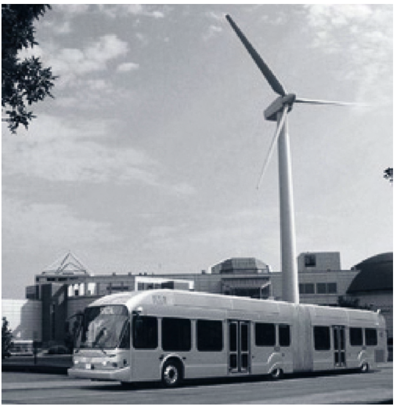
NASA's Glenn Research Center is designing a wind/sun-powered fueling system with zero carbon emissions for specially equipped city buses. An electrolyzer splits water molecules into oxygen and hydrogen, to be used for fuel cell-powered vehicles.

The LEEDCo RFP was announced in late March to coincide