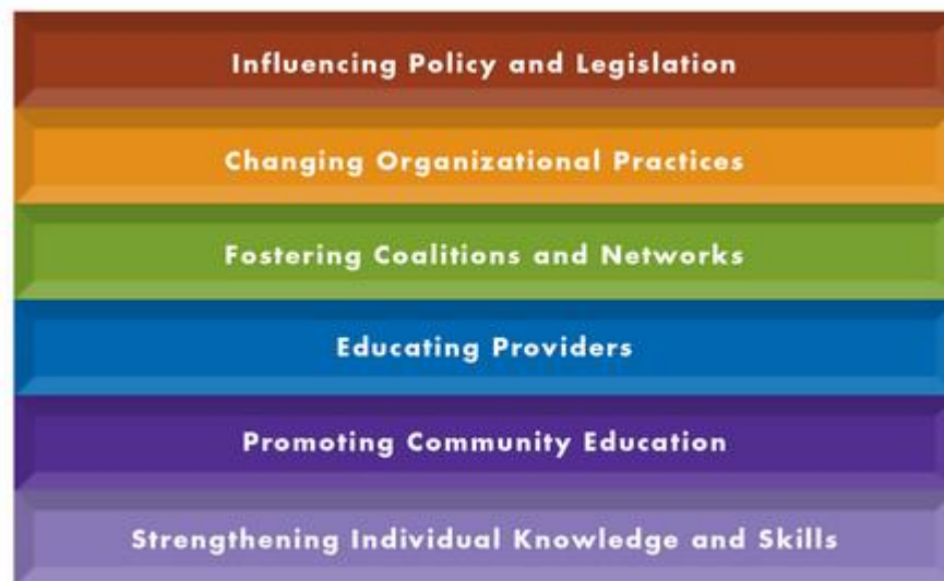
FIGURE 4. Spectrum of Prevention