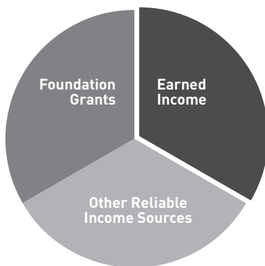
Earned Income as Part of a Financial Sustainability Plan

a fee for these services in order to cover at least part of the costs of programming.