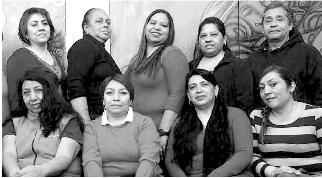
Members of Pa'lante Green Cleaning worker cooperative. Jackson Heights, Queens. 2014.