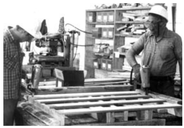
APPLIED INDUSTRIES: Wood product manufacturing, including pallets, accounts for more than 99 per cent of the company's sales; during FY00 alone, the company produced nearly 95,000 wooden pallets