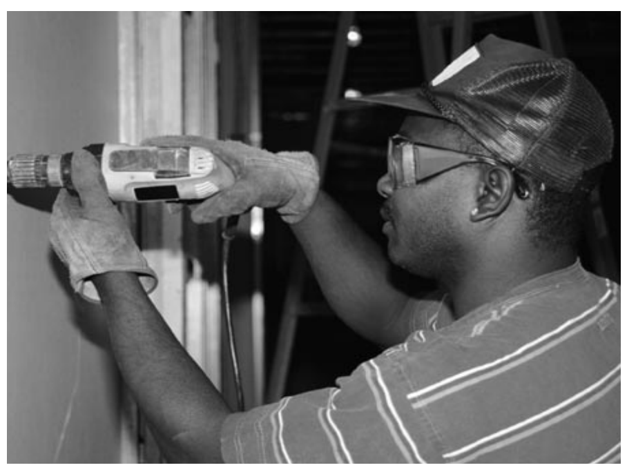
NEW U TEMPS: More than 70 people work for the temporary staffing business operated by Pillsbury United Communities in Minneapolis and St. Paul.

Speed: "You have to be able to move on a dime," says Wagner. "When employers need someone, they need someone now. It's always surprising to me how many employers don't