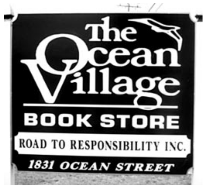
OCEAN VILLAGE VENTURES: Road to Responsibility operates seven businesses, including three bookstores, two motels, an ice cream store and a function hall.

The first venture came into existence about a year after the New Ventures Committee had outlined its vision and alerted the organization's stakeholders.