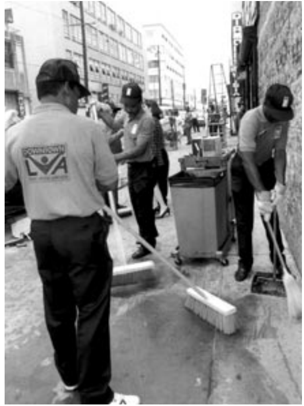
CHRYSALIS STREETWORKS: The people who work for the organization's street maintenance business helped generate $1.5 million in revenue during the most recent fiscal year.

That re-positioning accelerated sales dramatically and enabled the company to compete more effectively with organizations such as Labor Ready, a for-profit company with annual sales of close to a