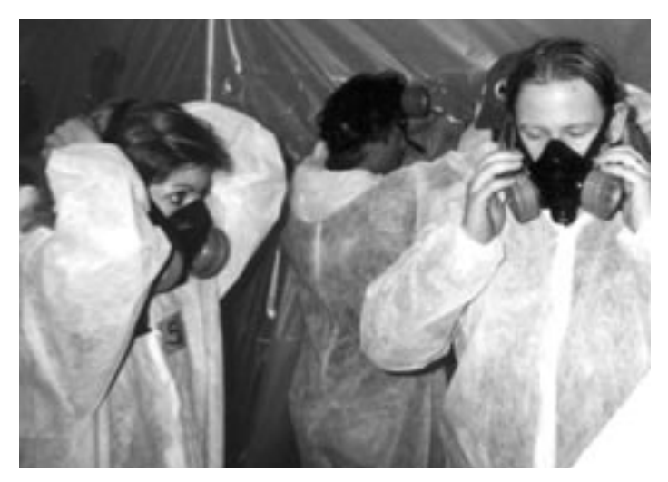
SKOOKUM ABATEMENT SERVICES: Employees don protective gear before entering a contaminated area.