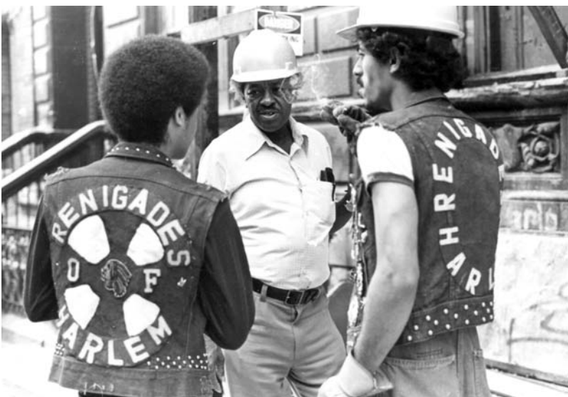
Members of the Renigades construction crew at their sweat equity project site, 251 East 119th St.

vision of self-help housing could squeeze itself around existing laws and government programs.