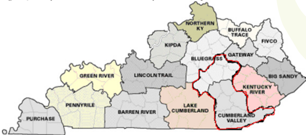
Figure 3: Study Area in Relation to Kentucky Area Development Districts