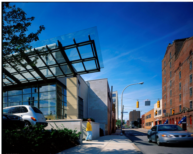
Entrance to Whole Foods parking lot, East Liberty, Pittsburgh

Exit Strategy. How, when, and for what price will the CDC agree to be bought out by the for-profit, or vice versa? This key point should be covered in the operating or partnership agreement.