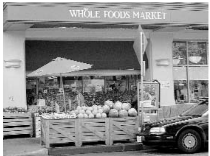
The Noyes Foundation invests in companies like Whole Foods, the world’s largest retailer of natural and organic foods, along with other firms that are committed to the environment.

Most of the program-related investments are in the form of low-interest loans to nonprofits. To take just one recent example, in 2000, Heron approved a five-year, $250,000 loan to the Greyston Foundation, a system of nonprofit and for-profit organizations in Yonkers, N.Y., that offers a wide array of programs and services for individuals seeking self-sufficiency. Greyston Bakery, the sole supplier of fudge brownies for Ben & Jerry’s ice