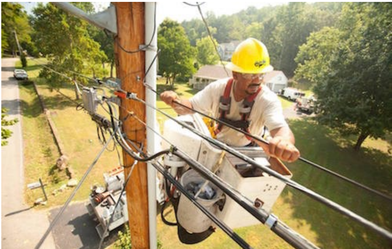
Chattanooga EPB Lineman

1 Chattanooga's EPB Fiber Optics is doing extreeeeeeeeemly well. Though the authors paint a bleak picture for it, the utility has just announced that it has paid off all the debt on the communications equipment. 11 The debt for the electric side has such a low interest rate, they see no reason to retire it early at this point. The utility has more than 90,000 subscribers and projecting net income of $26.6 million in FY 2017. It has no problem paying all of its costs and has a very secure future, but the flows may still not be balanced because the one time cost of connecting all those subscribers was significant. 12 Chattanooga's Electric Power Board has reported that its electric rates would be 7 percent higher if it did not have the fiber network and communications services.