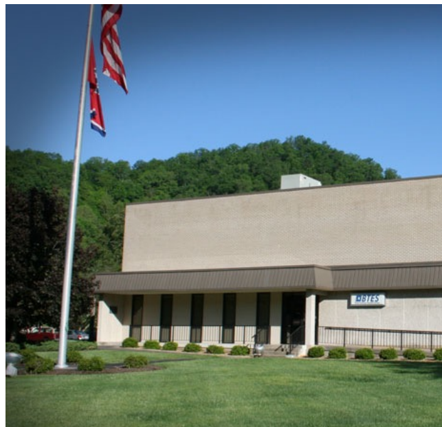
BTES Headquarters

The authors seem puzzled that the media has not caught on to the supposed story that Wilson's Greenlight Fiber network is exhibiting financial distress. 13 The media isn't confused, the authors are. When evaluated correctly, Wilson's Greenlight is financially strong. The network invested significantly in early years to connect subscribers and is in no danger of being unable to pay its operating costs or debts. Wilson's top 10 employers all use the municipal fiber network and more than 700 additional local businesses rely on it. The fiber was even cited as a factor in the utility's ability to decrease its electric rates 18 percent. 14