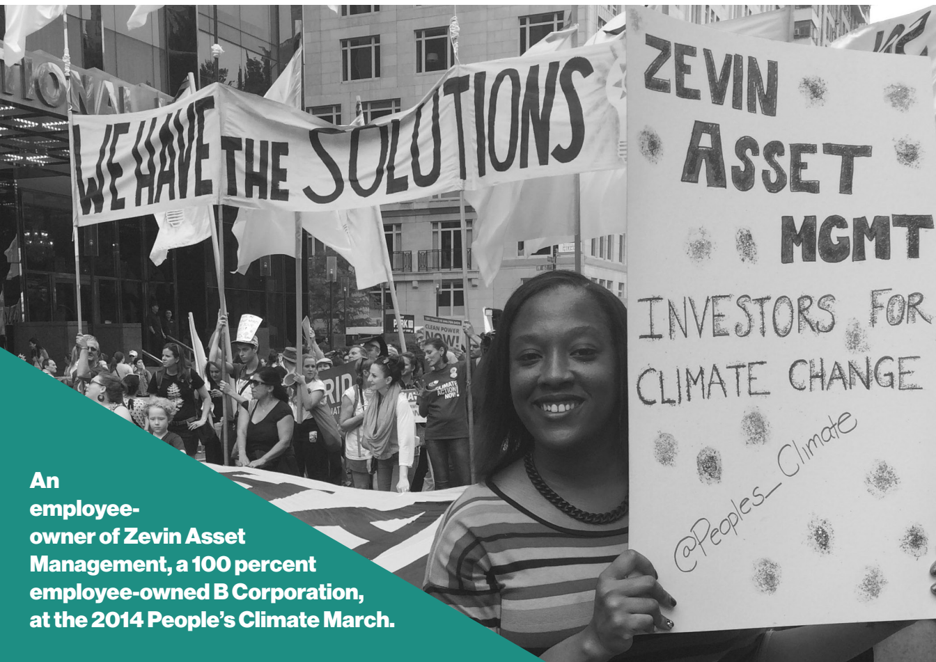
An employee-owner of Zevin Asset Management, a 100 percent employee-owned B Corporation, at the 2014 People's Climate March.

We have identified more than 50 employee-owned B/benefit corporations. In addition, we have found more than two dozen employee-owned firms with strong social or environmental missions that have not yet chosen to formalize these commitments in their corporate structures. For some, the certification process is too arduous or expen-