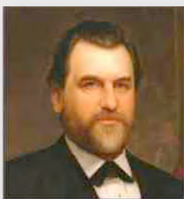
Leland Stanford Central Pacific Railroad CEO 19th century handout recipient