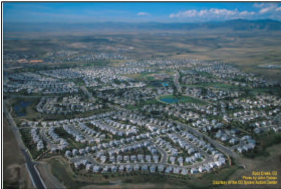
Figure 1. New residential development in the Denver metropolitan region.

Traffic congestion, poor air quality, suburban sprawl, and urban decay have prompted a movement referred to as “smart growth.” As seen in Figures 1 and 2, sprawling developments across the United States are consuming land and generating congested highways. They are also leading to a host of other economic, environmental, and social problems.